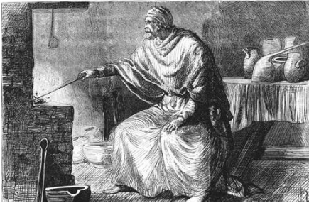
In the Hands of the Refiner