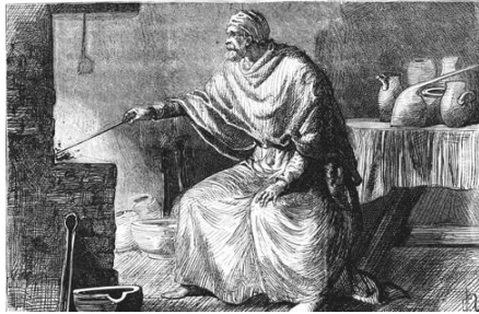
In the Hands of the Refiner