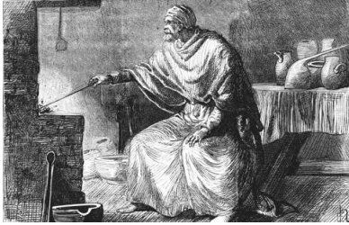
In the Hands of the Refiner