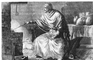
In the Hands of the Refiner