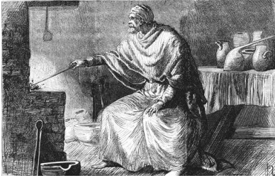
In the Hands of the Refiner