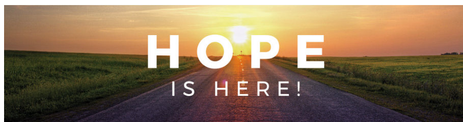
New Message Series "Hope Is Here"