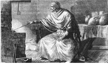
In the Hands of the Refiner