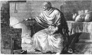
In the Hands of the Refiner