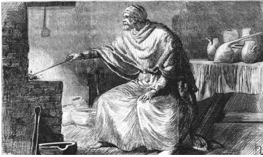
In the Hands of the Refiner