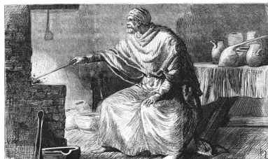
In the Hands of the Refiner