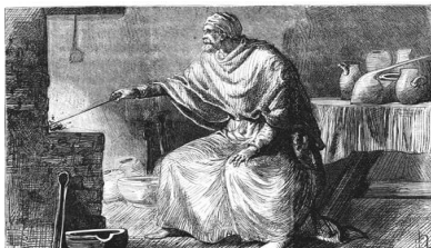
In the Hands of the Refiner